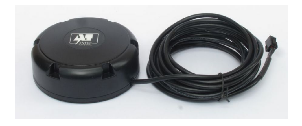
AT GNSS-01 Multi System GPS Receiver - Tracking